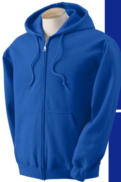
front upper left chest