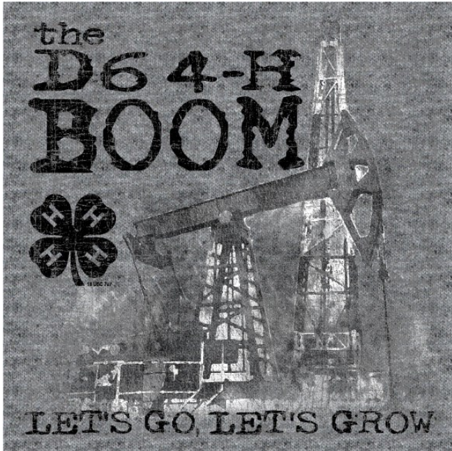
front full chest (t-shirt)

Delivery: Items will be mailed to each County Extension Office by Nov. 1, 2013.